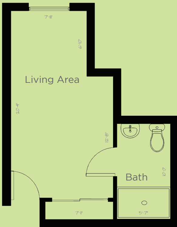
STUDIO 258 sq. ft